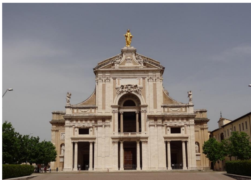
Basilica S. Maria degli Angeli, Assisi