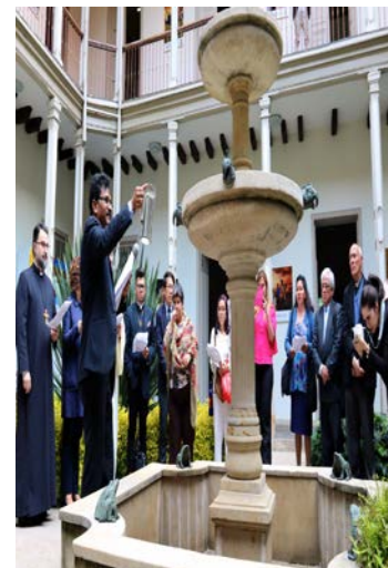
2018 Lenten campaign "Seven Weeks for Water" begins in Colombia