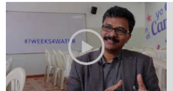
Seven Weeks for Water 2018