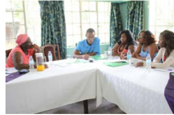
Voices of hope - Zimbabwean church leaders and communication