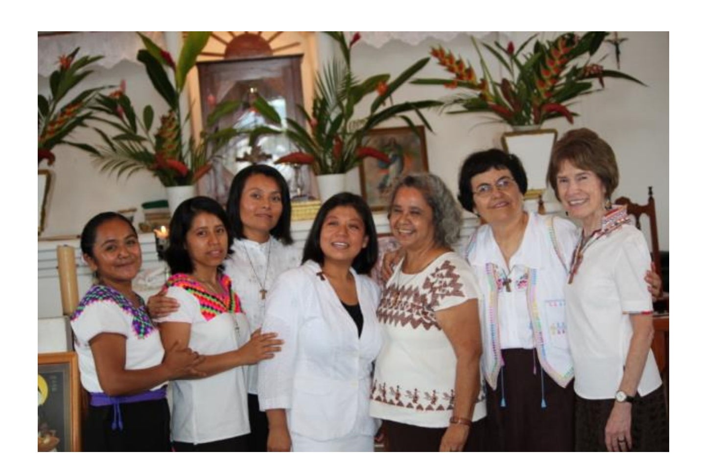
Sisters of the Community in Palenque, Chiapas, Mexico

As sisters and brothers in Palenque we gather the first fruits of our diversity, our intercultural living of the Gospel, and place them on the Mayan Altar with reverence and gratitude. "The Word was made flesh and dwells among us." (Jn. 1, 14)