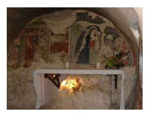
Greccio

"Francis continually contemplated and marvelled at three mysteries in the life of Jesus: the humble descent of God into our flesh and blood in the Incarnation of Jesus, the humble descent of Jesus into the darkest depths of our lives in his suffering and Jesus' humble self-giving to humanity in the Eucharist.